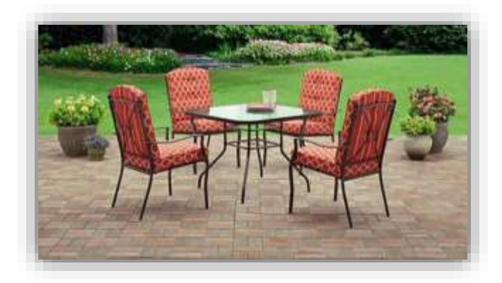
Table and four (4) chairs with cushions Give your patio, porch or deck a great new look for summer