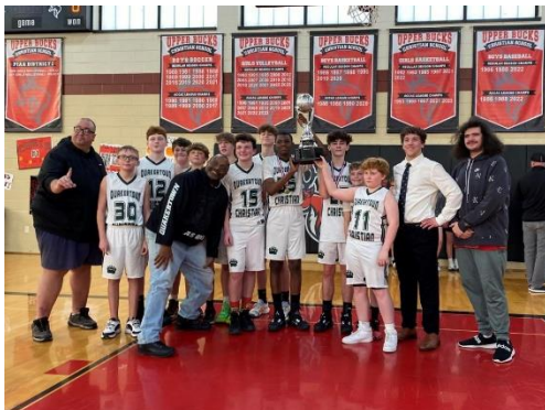
The 2023-2024 MS Bears hoist their ACCAC Championship Trophy