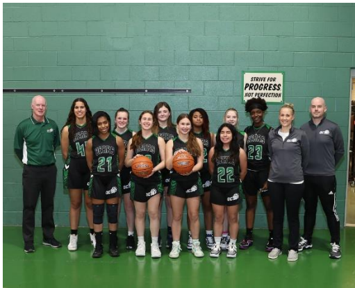
2023-2024 HS Girls Basketball Team

Our "Bears on 3" cheer takes on new meaning next year as we look to our third season together. We look forward to the workouts, practices, games, tournaments, and ultimately the growth that is still yet to come. Thank you to the players, parents, and entire QCS family for supporting our girls this season. Girls, as we enter the offseason, it's officially your time. BEARS ON 3!