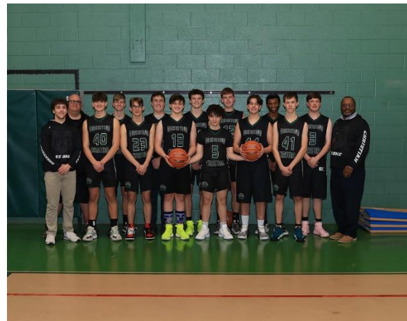
2023-2024 HS Boys Basketball Team